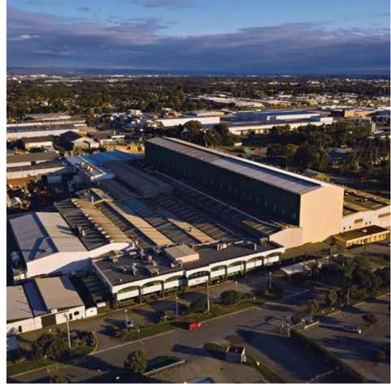
• Hofmann PERTH , WA

Sales and engineering sourcing offices with detailed metallurgical, mechanical and inspection capability: