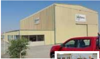
• Hofmann Engineering CHILE