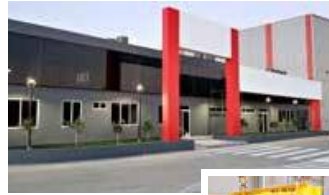
• Hofmann Engineering PERU