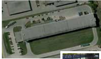
• Hofmann Engineering NORTH AMERICA